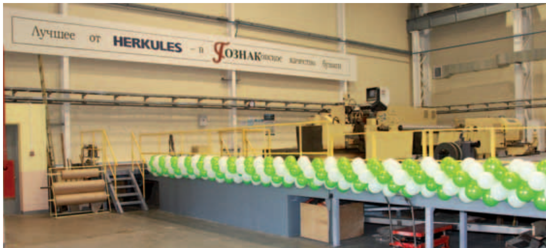
Festive commissioning with a self-made banner: "The best of Herkules for Goznak quality paper".