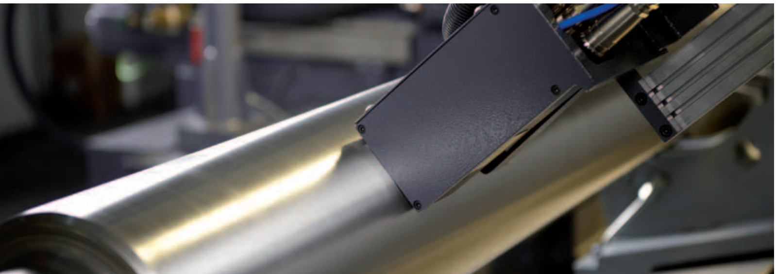
New on the Chinese market: The Roll Surface Inspection System detects flaws on the roll surface before it comes to defects.

Roll grinder for Krasnokamsker Papierfabrik Goznak